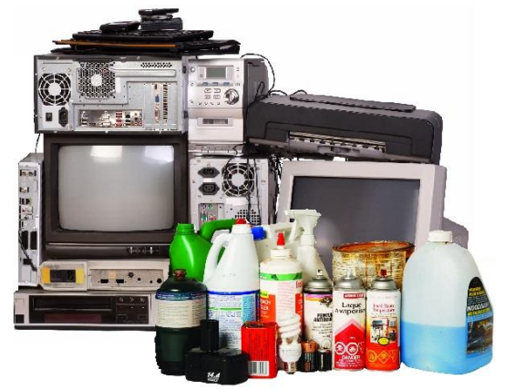
Click for Event Details.

Old TVs, computers, stereo equipment, along with cleaners, pesticides, automotive fluids, and even medicine can be dropped off at this event. It is the last Spring Collection. We will offer a couple more in the Fall!